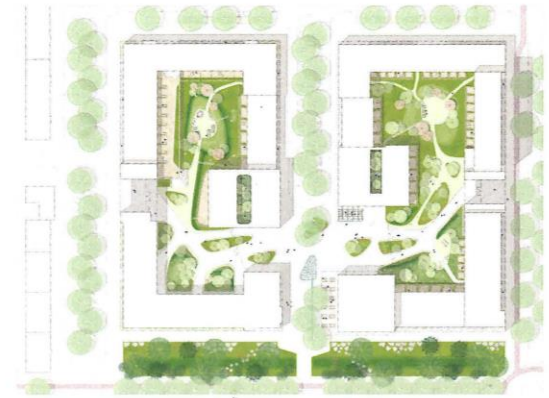
Landscape design for the inner courtyards of two new residential blocks in Amsterdam-West.