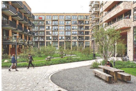
Along the public route that winds through the residential blocks, seating and lounging areas have been created for relaxation and socialising.

'Soft, green, atmospheric – a valuable answer for how to design residential landscapes in the densely built-up cities of Northern Europe'