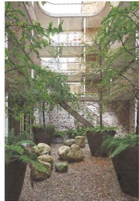
The stairwells have been given a green design, bringing nature into the building's core.

Programme courtyards and patio in a housing complex Location Amsterdam, Netherlands Designers Bureau B+B stedebouw en landschapsarchitectuur In collaboration with Arons en Gelauff, KENK architecten Commissioned by Lieven de Key housing association, Amsterdam Area 1.1 ha Design 2017-2020 Implementation 2019-2022 Budget € 942,000 www.bplusb.nl