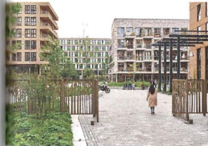
The distinctive fences signal to passersby that they are entering a residential area, subtly marking the boundary.