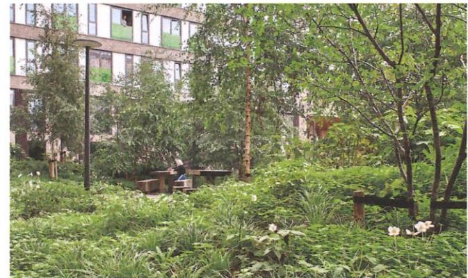
At times, the inner gardens take on a forest-like feel.